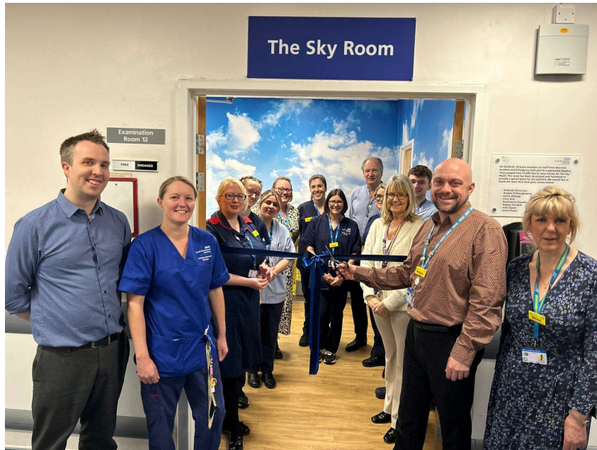
A group of fundraisers from the ED team took on a charity Sky Dive to raise funds for the new “Sky