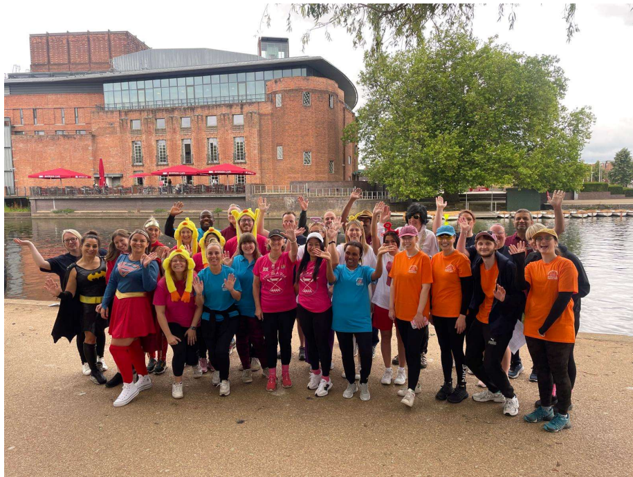
Room”, which provides a comfortable environment for end-of-life patients at the Emergency Department.