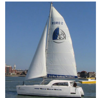
Photo Gallery & Testimonials – Participant Feedback – PRC Sailing Recovery Voyage