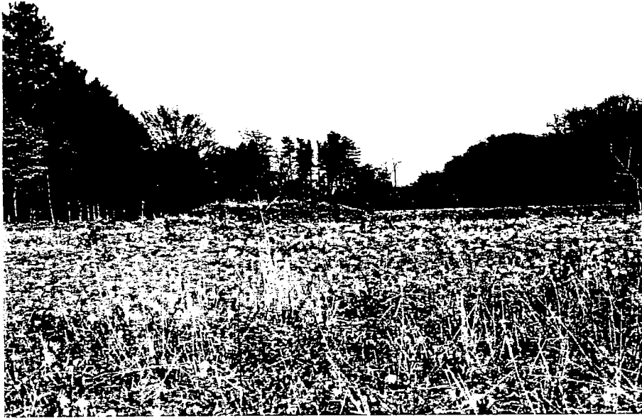
Cowslips on Heyshott Down - a truly impressive display - as were some of the orchids. Left Bee orchid, right Butterfly orchid.