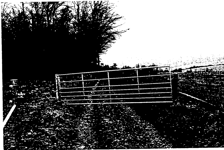
New gate for cattle access at Devils Jumps. They can now be driven directly from the grazier's land to the reserve.

Whilst pulling young Birch works well (see 2016 Report), Bramble tends to snap, leaving a large food store (the caudex) in the ground. As this is an underground stem, not a root, it rapidly shoots again. However, if the new shoots are removed before they have a chance to return much food to the store it is possible to, eventually, starve the plant to death. A programme of mowing over the worst Bramble patches, several times a year is underway to back up the cattle grazing. We know it will be a long job.