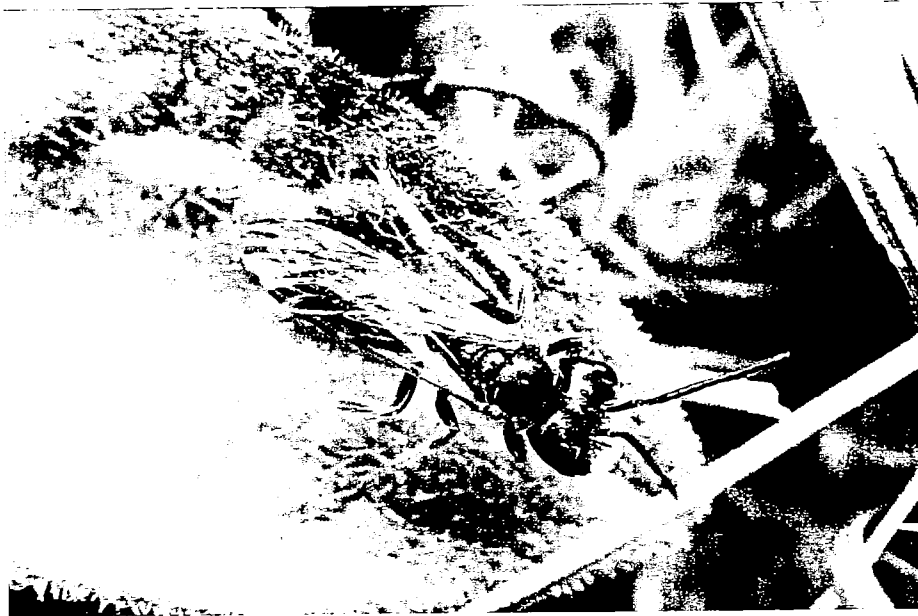
Not to be outdone, the mining bee. Andrena bucephala , above, and the Wasp Spider Argiope bruennichii , below.