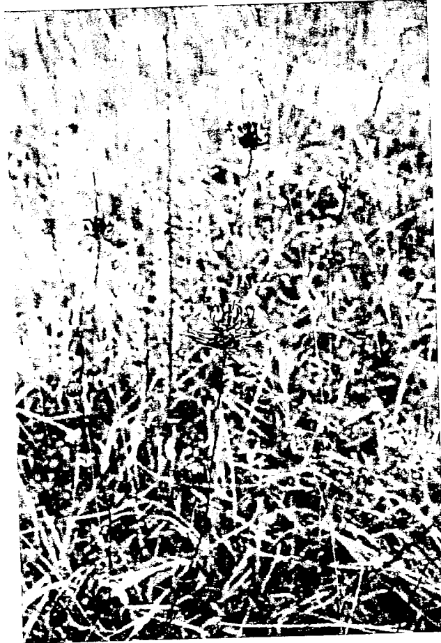
Round-headed Rampion on Heyshott Escarpment. This species has increased on the western area over the past ten years