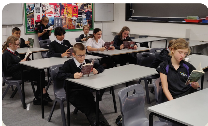
The North Cambridge Academy (part of the Ogden North Cambridge Partnership) runs a science book club for Year 7 and Year 8 students.

CERN showcases a range of careers connected to physics and students can use their experience to inform future education and career choices. Unfortunately, it has not been possible for any partnership trips to CERN to take place this year.