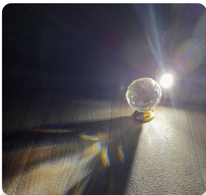
Warrington Partnership photo competition showing refraction – when light passes through an object with a higher density causing the rays to change direction.