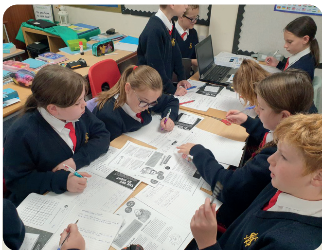
Year 6 pupils at St Matthew's Catholic Primary School using Ogden research cards.

Collectively, our resources have been downloaded nearly 40,000 times over the past 17 months (April 2020-August 2021); our working scientifically resources remain the most popular and they have been downloaded more than 14,500 times.