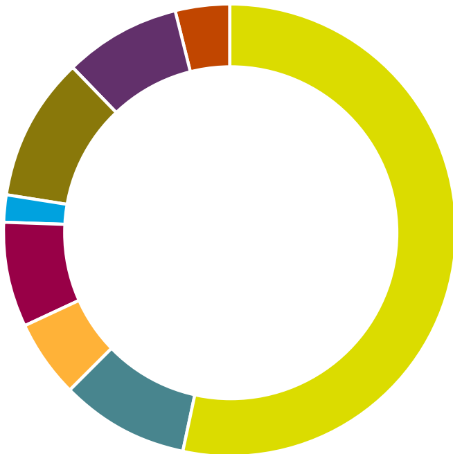
Expenditure by programme April 2020–August 2021