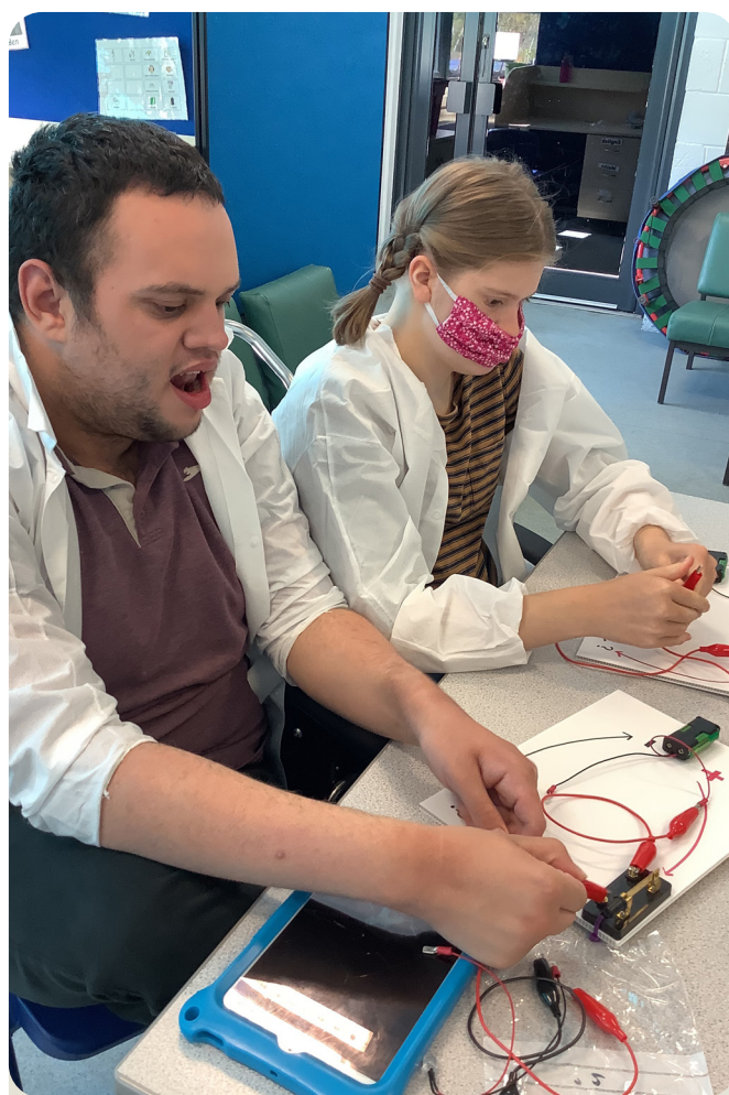
The Trust is working with The Lightyear Foundation to ensure resources are more accessible to all learners.

We will be piloting a scheme to develop technician communities of practice