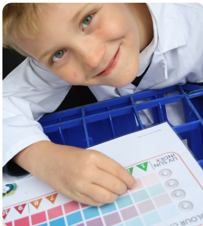
Investigating the UV scale as Phizzi Light and Sound is finalised.

As partnerships enter their legacy phase, a further CPD module is now available to encourage primary schools to think about their next steps and how to incorporate their Phizzi enquiries into future action plans. Phizzi Forward provides an opportunity for schools to reflect on how their Phizzi CPD is being implemented, how the resources are being used and how teaching and learning has improved. The Light and Sound CPD programme was postponed and will now be delivered during the 2021/22 academic year.