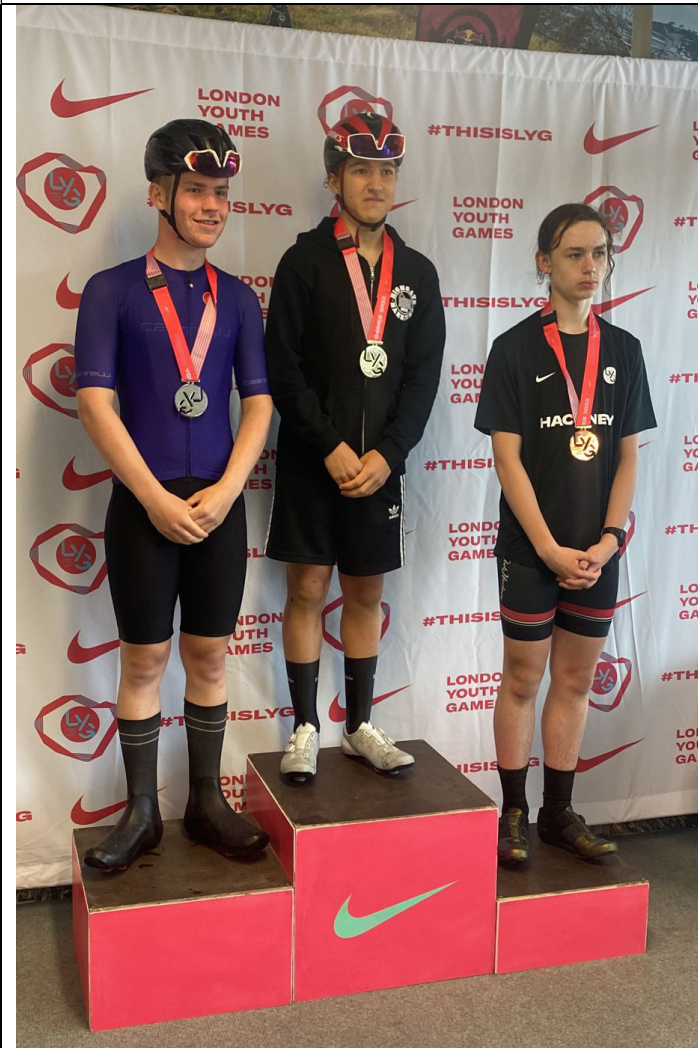
London Youth Games