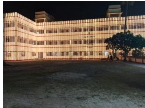
Photo (taken at night) after the inauguration of the Hostel above, and Primary School below.