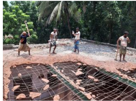
Demolition of the hostel June 2023.