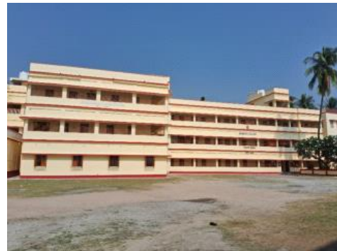
Completed boys' hostel October 2025.