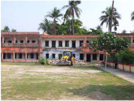
The derelict boys' hostel January 2023.