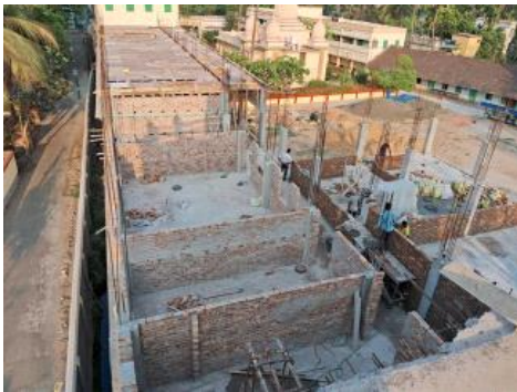
A stage in the construction of the hostel Oct 2023.