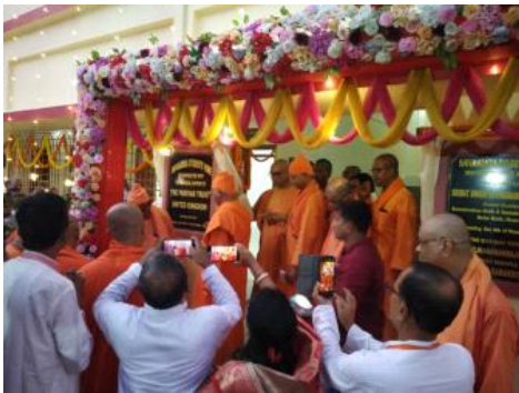
Inauguration of Boys' Hostel 4 th November 2025, above, and the inauguration of Primary School below.