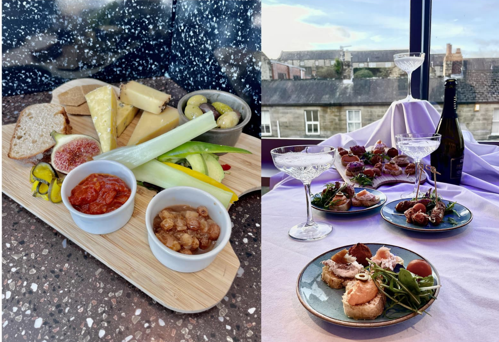
Playhouse cheese platter and our champagne and canapes offer