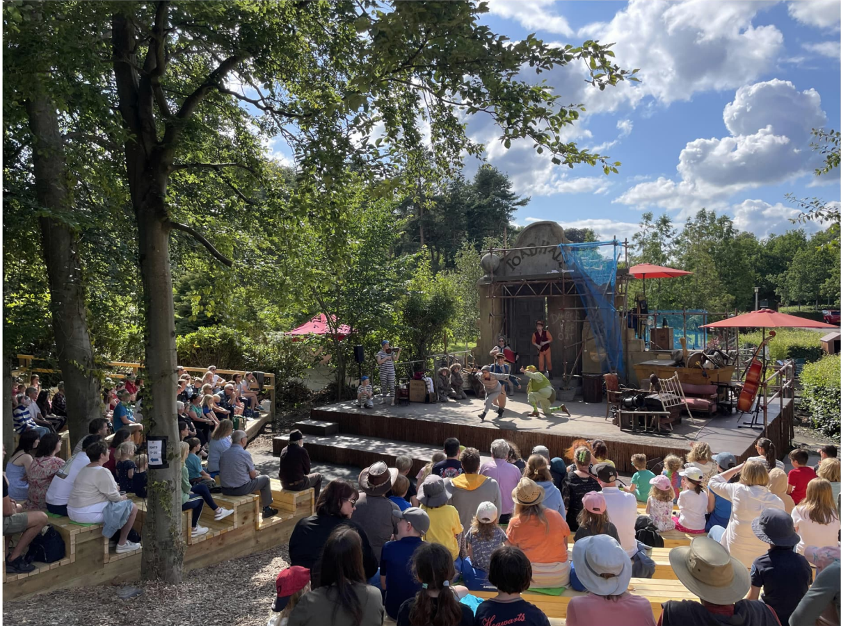
Wind In The Willows an immersive production in Alnwick Gardens July/August '23

The Trustees present their annual report together with the financial statements for the year ended 31 March 2024.