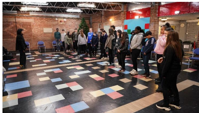
Rewind and Fast Forward (workshop)

In schools, we will continue to work closely with principals and school representatives to assist Sudden Productions in reaching schools in underserved communities with positive mental health messaging in ISOLATED for example or support to build healthy relationships with REWIND AND FAST FORWARD or messaging on inclusion & diversity in WHAT MATTERS or MY GRANDPARENTS, MY PARENTS AND I .