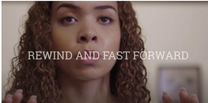
Rewind and Fast Forward (Film)

Our strong partnerships with Maryvale Community Centre, St Basils, Hawkesley Community Centre and the Sanctuary enable Sudden Productions' arts educators to deliver enriching workshops to young and/or vulnerable people through up ten months programs for some organisations.