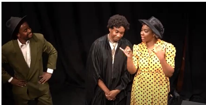
My Grandparents, My Parents and I

Our mission is to inspire and entertain young audiences through quality theatrical productions and educational programs. With the support of our dedicated team, enthusiastic volunteers and generous donors, we have been able to make a significant impact on the lives of young people and families from all communities. Included in this direction, is celebrating diversity, inclusion and arts equity that Sudden Productions strives for in the representation of different cultures, experiences and orientations.