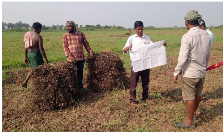
An officer from the Agricultural Dept. gives advice on growing moong beans

The pilot has recruited 180 farmers (both men and women) to participate in a programme which will undertake crop rotation, with the cultivation of black, green and horse gram (all legumes), production of green manure (dhandicha and nalita), cultivation of green vegetables, multi-cropping, and large-scale compost-making. The Agricultural Dept. provides the expertise, seed and grants to participating farmers. A digital crop survey of 500 plots has been carried out enabling farmers to