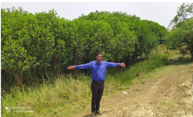
Rama celebrates the extent of one of our plantation areas; all this, and more!

So we still have an important role to play, and it is a great relief that we are no longer doing this single-handed.