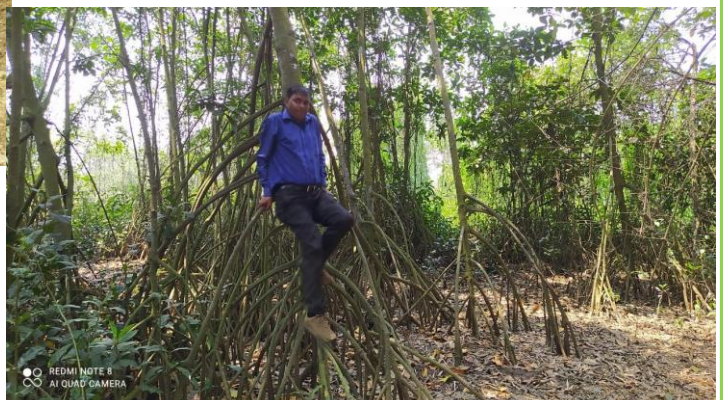
and demonstrates the strength of the mangrove's stilt roots.