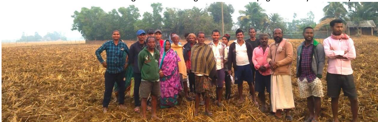
Pictured above, some of the farmers participating in our Topsoil Fertility Programme And greetings from everyone in Odisha who benefits from your generosity

We hope you enjoy reading about our work and all that our projects are achieving with your generosity. We feel very proud of what we help happen, bringing positive change to the lives of so many people, and it would not be possible without your help. The need for support continues – there are always more ways to spend money than raise it! Please help if you can. Your donations make a tremendous difference to the lives of people and communities. Details for making a donation are given on the last page. Thank you to everyone.