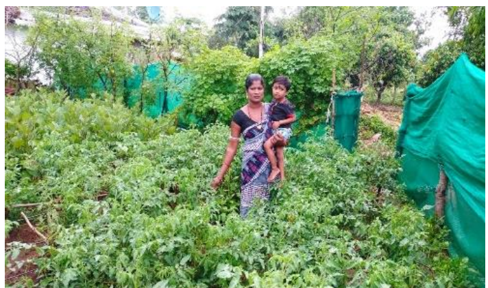
Kitchen gardens are a vital part of an integrated agricultural system

There is no magic bullet, but we hope that by investing in these farming families, we can help to secure their future in their home villages.