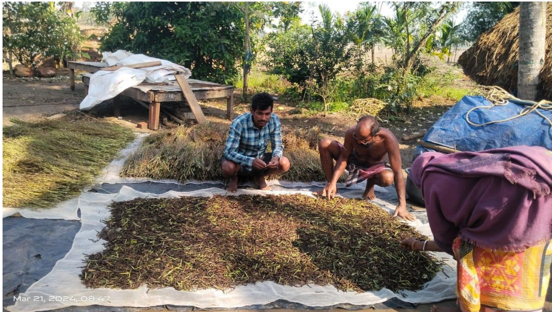
Participating farmers are delighted with the first mung bean harvest

Originally, the proposal was for a small-scale pilot, with only five farmers, but because of the enthusiasm and commitment of our partner, the work is being carried out on a much larger scale. The pilot is now ten months into its first year. Yields have been good, and so far all those who have been involved are delighted with the progress. We hope that this will help secure a future for local farmers.