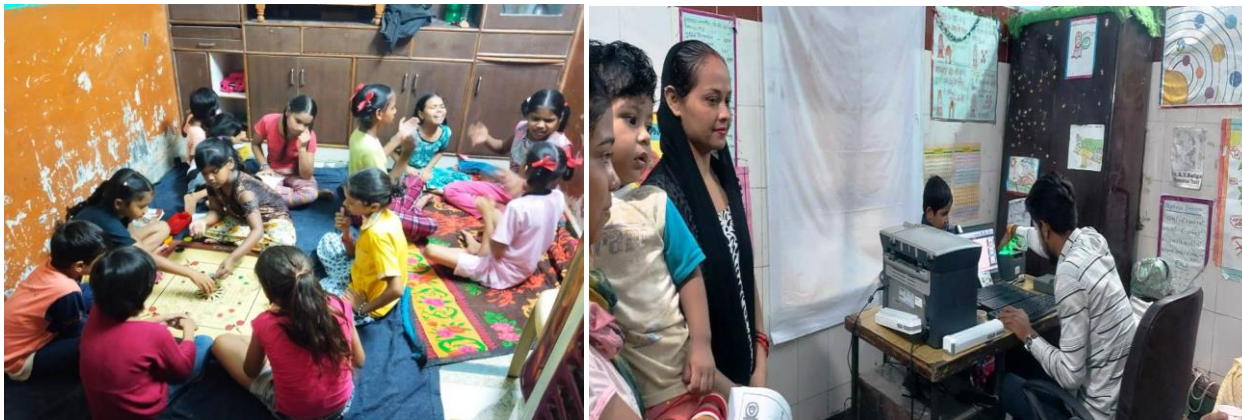
Play and learn in a Remedial Education Centre Children get regular health and eye checks at the Centres