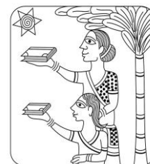
Dr. A.V. Baliga Memorial Trust

One of the themes of this newsletter has been the real value of investing in projects over a long period, and this has been the case in our relationship with the Baliga Trust. We have been involved with them for almost twenty years, providing just a small amount of money at a time, but maintaining our commitment to their work, and supporting them in a range of ways as they continued to grow. We have always valued the quality of their work, which speaks in the vitality of everyone involved – staff, teachers, volunteers, families and especially in the children. We still provide funding to help support Remedial Education Centres, and our funding means that the Baliga Trust is able to carry out additional activities with the children – drama and music, sports and visits to some of the national institutions in Delhi, activities in which these children would never normally be able to take part. All this with the help of our donors. Thank you, all of you.