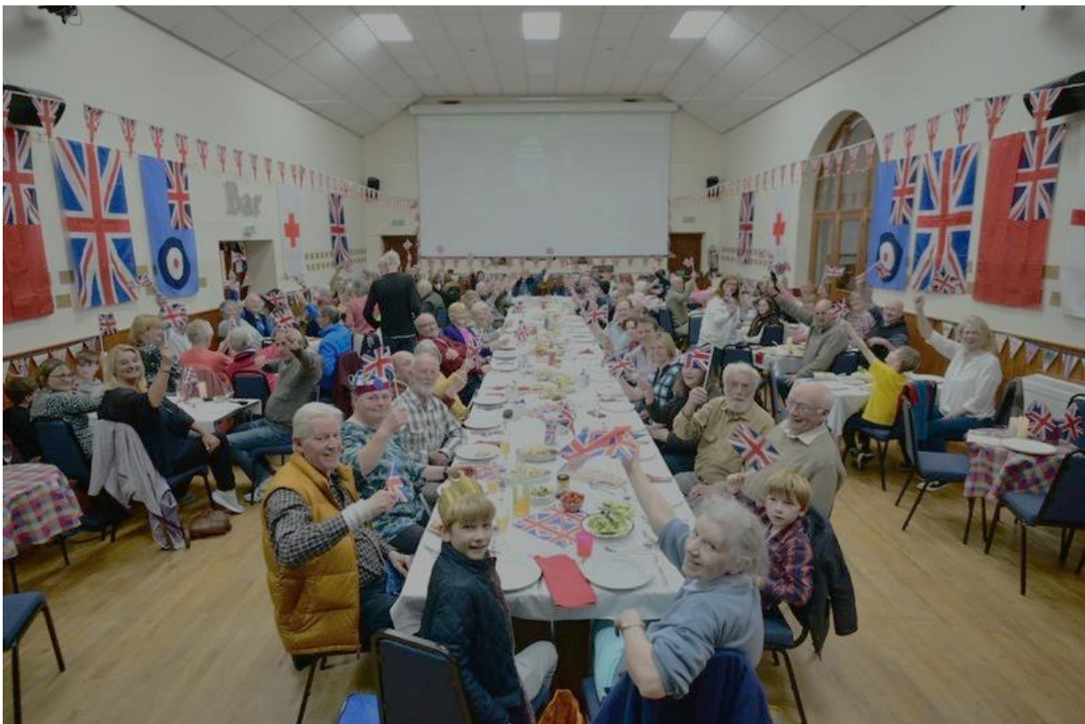
Queen's Platinum Jubilee Celebration (Organised by MiCE)