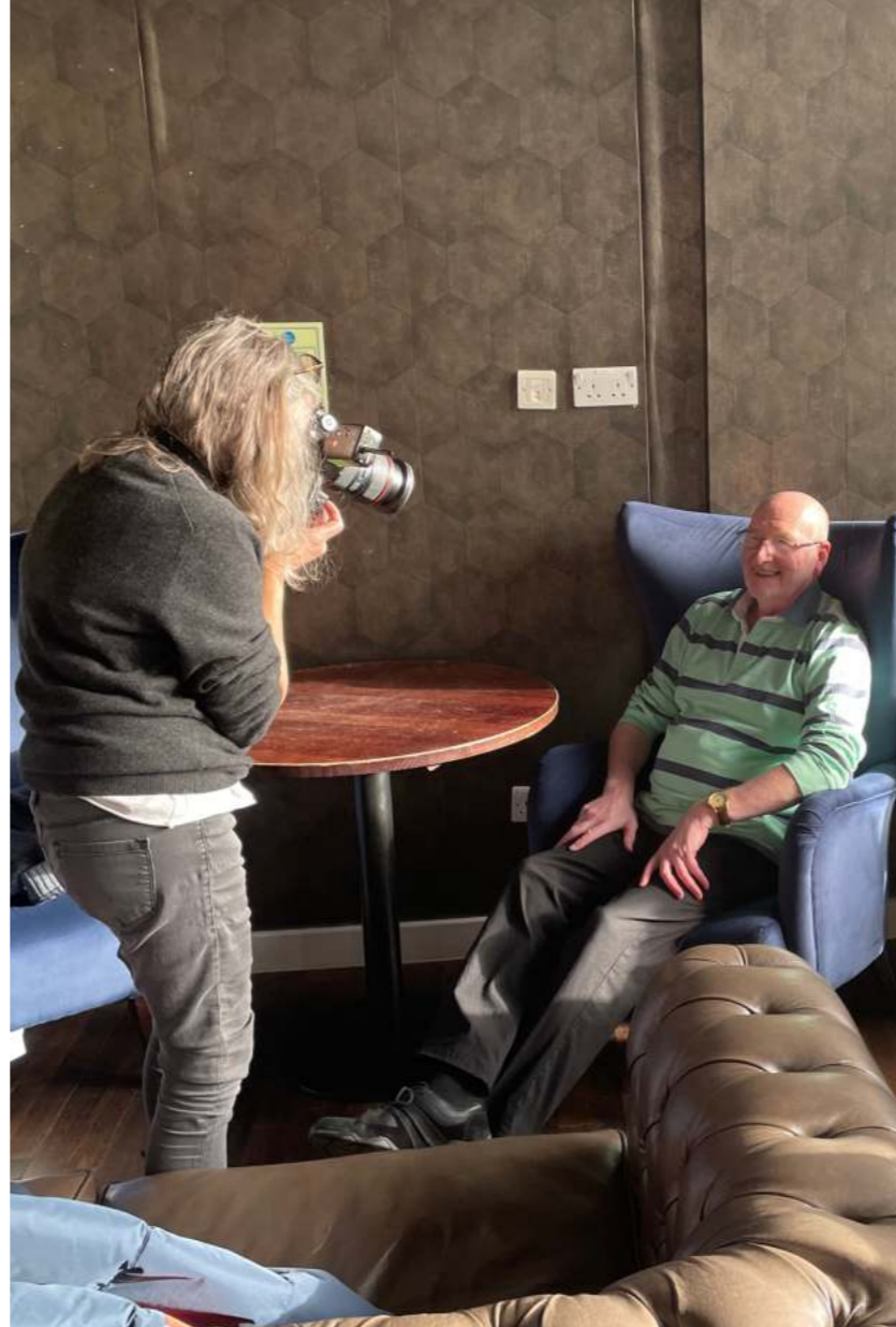
Behind the scenes at the Saga photoshoot featuring older Silver Rainbows members and their stories.