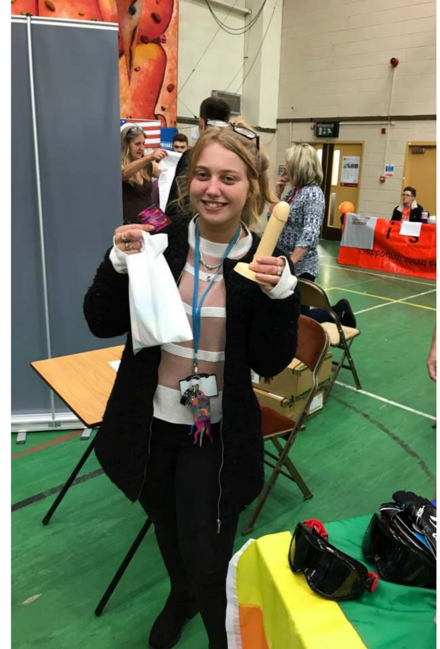
The SexSmart continues to develop new and innovative ways of communicating messages around consent, healthy relationships and STIs.