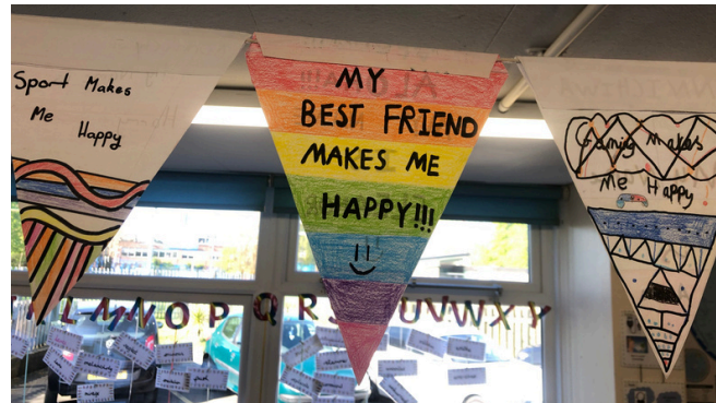
Bunting exchanged by linking classes on display

Once again, this year Global Learning Leeds delivered the Leeds school linking programme for The Linking Network . We supported 10 link partnerships of contrasting settings across Leeds, both primary and secondary, to explore themes of identity and belonging. We created a film where children and teachers shared how the linking with another school deepened their understanding of themselves and others, built intercultural understanding and helped to bridge differences between communities.