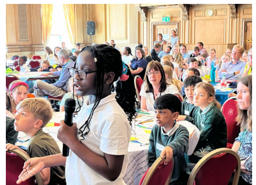
A pupil sharing her thoughts on climate change at our Eco Conference.

In March 2025 we held a Climate Schools Eco Conference for teachers and KS2 / 3 students. Schools and support organisations showcased their work and shared ideas, enthusiasm and passion. One teacher said that they were leaving with "a renewed sense that we are, all together, part of the solution"