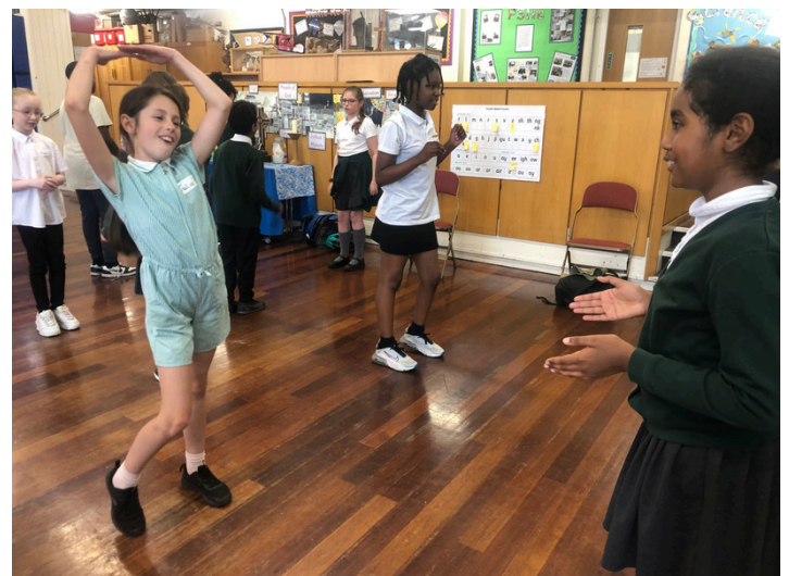
Pupils from Valley View and All Saints Richmond Hill getting to know each other on a class visit.