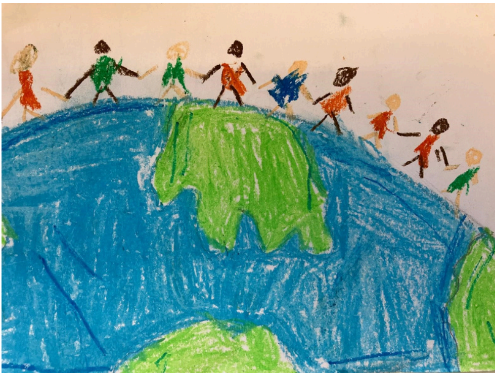
Children's artwork exploring community and belonging.

The project brought together a fantastic group of Community Champions from KS2 in 3 Harehills schools; Hovingham, Harehills and Coop Nightingale. The children worked together through a series of weekly meetings to consider: identity, where we come from and stories of migration; what it means to belong and what happens when people don't feel they belong; discrimination and racism. They also explored how we can all live well together in community where we all belong? The Community Champions took back their learning to their classes and introduced the themes to their peers, who then went home and discussed key questions at home too. They also made plans to put their reflections into a song and to share their learning through an exhibition in Harehills to invite the local community into their conversation as well as planning to share with other schools across Leeds through a Live Lesson. This project continues into the next year.