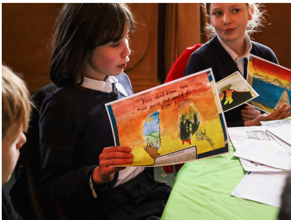
Pupils sharing their climate work with other pupils at the March climate schools conference.

Climate Action Leeds funding enabled staff teams in West and East Leeds schools to access our impactful face-to-face Climate Curriculum CPD course, which is supported by an online platform created in partnership with, and featuring talks by, University of Leeds climate scientists.