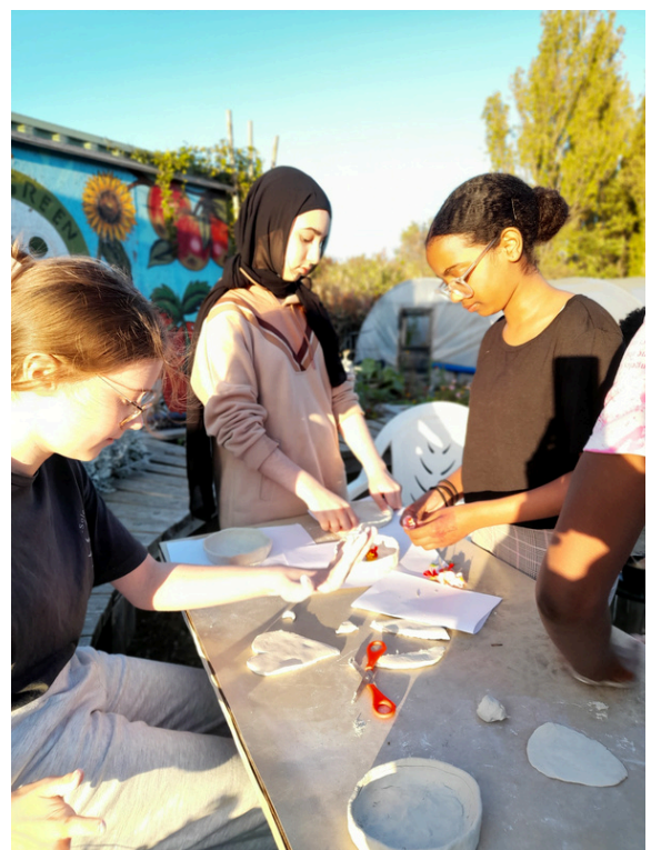
Young people cooking outside and creating clay craft at Cross Green Growing Together.