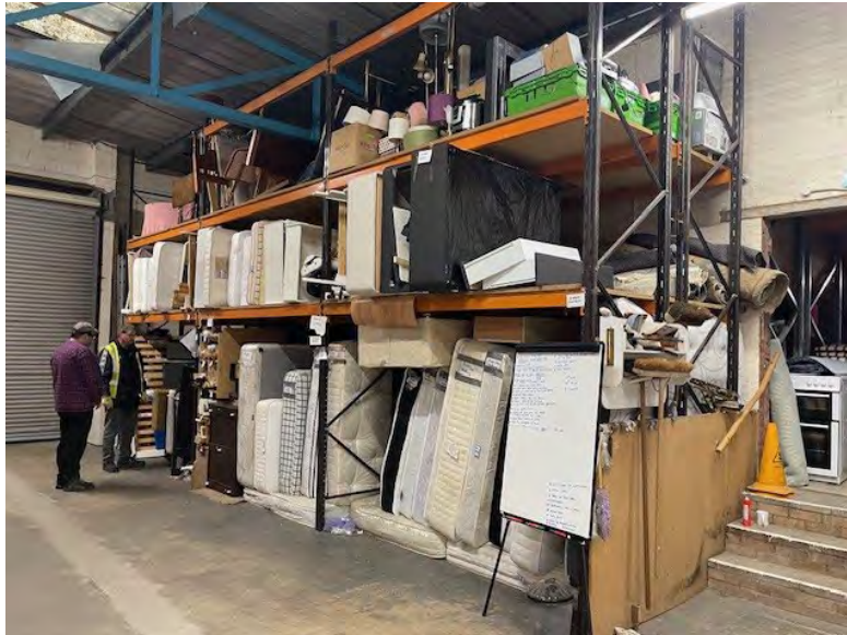
Beds and Mattresses

tested and checked for safe and reliable operation and all the sheets, duvets, pillow cases, towels etc are cleaned before being stored in the bedding bay.