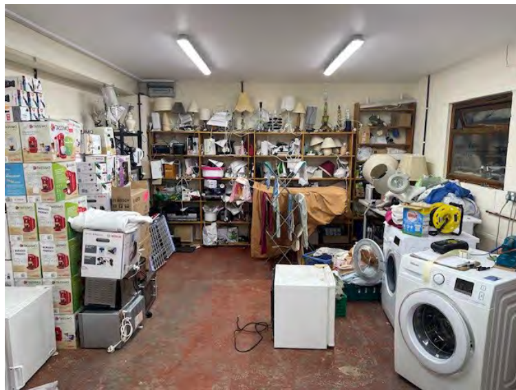
White Goods Testing in the Electrical Workshop

I also want to thank my fellow trustees who all bring their giftings and skills so that Daventry Contact remains a very well run charity.