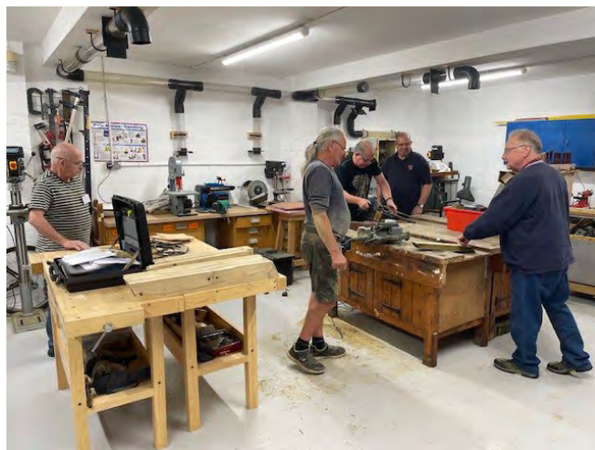
Men's Shed in the Daventry Contact Workshop

This year great progress has been made with the Daventry Men's Shed. After many months of preparation within the woodworking workshop a group of 15 men meet to socialise and to carry out various tasks involving woodwork, metal work and bicycle repairs. Another half day slot is being allocated to the Shed to cater for the increased numbers.