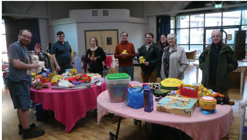
Staff and volunteers at the Grand Sale at the Saxon Suite – Daventry Leisure Centre

In order to raise extra funds we started to reinstate our local Grand Sale which was discontinued some years ago. This was held at the Saxon Suite within the Daventry Leisure Centre. Daventry is an ever expanding town and we were aware that we needed to create awareness of our presence and services to the newcomers.