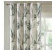
Curtains & Rods

I am also grateful to those in our local community who have been prepared, over many years, to donate quality furniture, white goods and household effects so that we are able to freely bless others in their times of need.