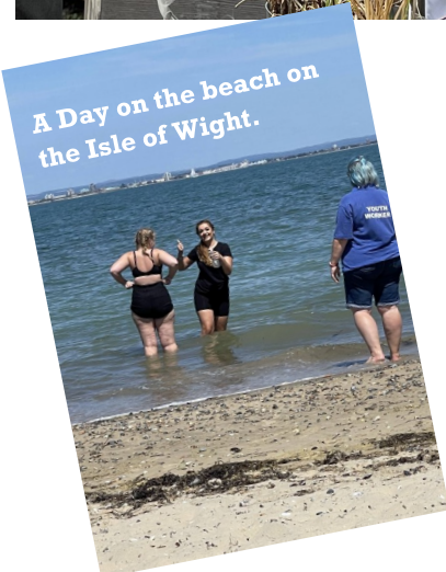
A Day on the beach on the Isle of Wight.