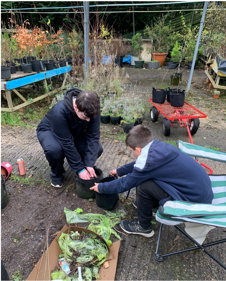
'Potting Up' in one of our Polytunnels. Mini enterprise - if they water and look after them, they get to sell and keep the profit. A relaxed work style demonstrated here!