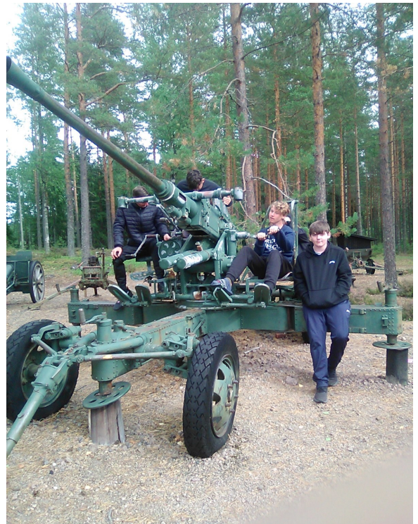
We visited the 'Bunkeri' museum on the Russian Border. Timely discussions as the Russians did their worst in Ukraine.