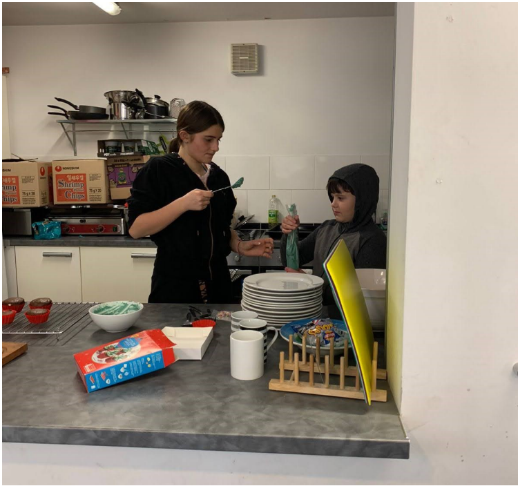
Cooking in our kitchen. Producing meals and treats for everyone is part of the preparation for life as adults.