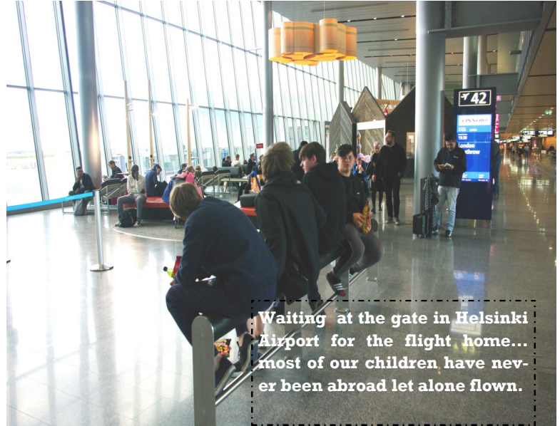
Waiting at the gate in Helsinki Airport for the flight home... most of our children have never been abroad let alone flown.