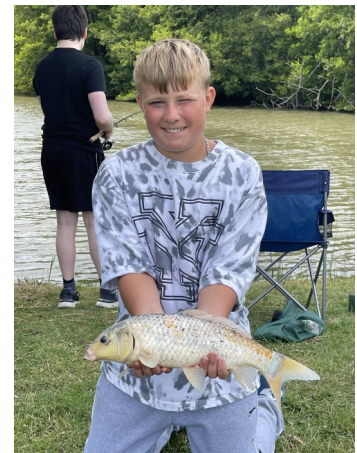
Same day, 3 fish, 3 boys, 3 smiles. Success makes such a difference in all our lives!