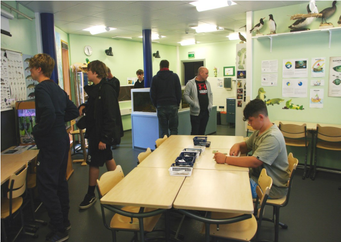
Back to the classroom in The Maritarium in Kotka to learn all about the fish and the environment of The Baltic.

were swimming this year. It's an amazing experience and a huge education for them to see the sea frozen and to feel minus temperatures in the same place they wandered in T shirts and shorts. The amount of personal and social training we get through in these weeks is truly life changing for many of our children and leaving their phones and computers at home means there is an element of education that possibly doesn't exist elsewhere in their lives. Amazingly they can make the end of a week here without their phones and without needing psychiatric counselling! (we are not sure the same can be said for the staff).