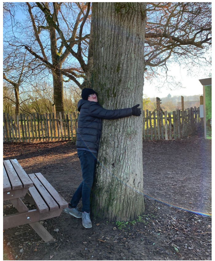
'Tree Hugging' is not on the curriculum but if you feel the urge.... !