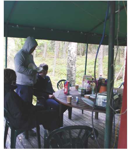
Breakfast taken on the cottage veranda, beside The Baltic