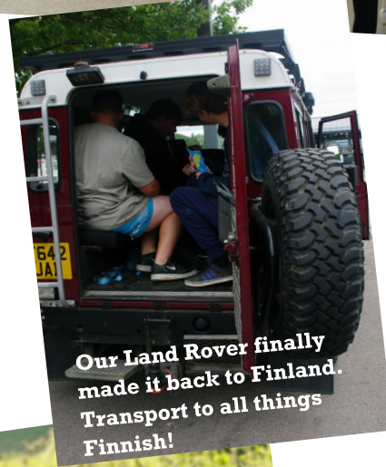
Our Land Rover finally made it back to Finland. Transport to all things Finnish!