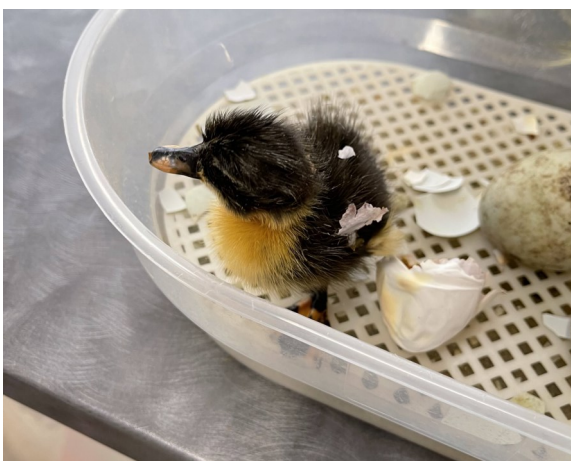
Hatched our own ducks this year!