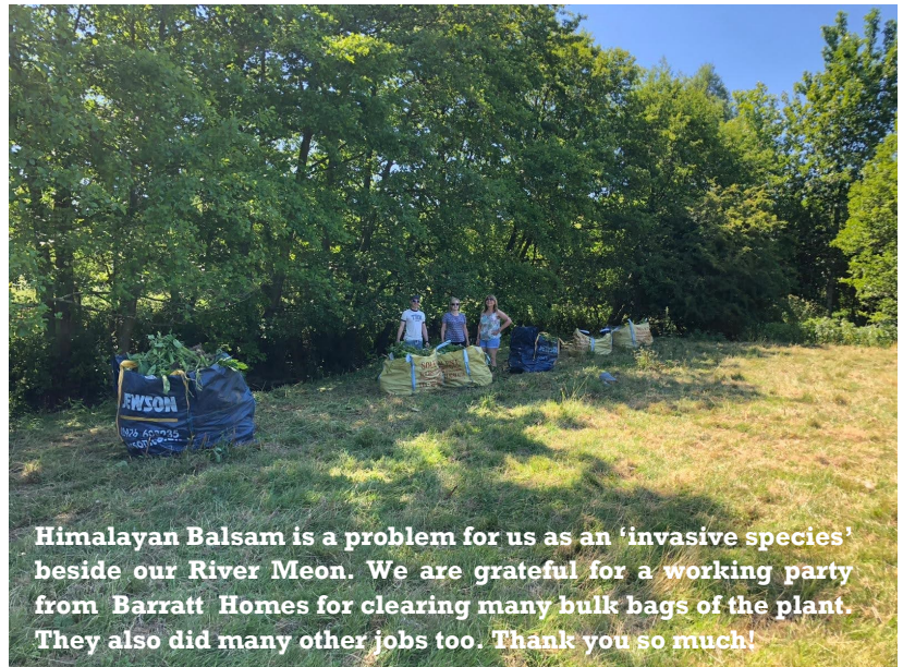
Himalayan Balsam is a problem for us as an 'invasive species' beside our River Meon. We are grateful for a working party from Barratt Homes for clearing many bulk bags of the plant. They also did many other jobs too. Thank you so much!