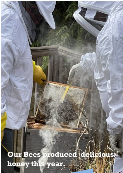
Our Bees produced delicious honey this year.