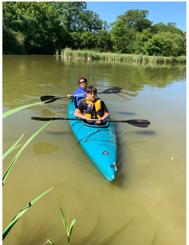
Canoeing on our largest lake was popular during the summer holidays.