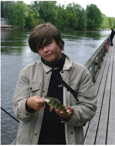
Small Perch on the spinner from the River Kymi.