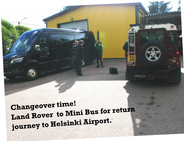
Changeover time! Land Rover to Mini Bus for return journey to Helsinki Airport.