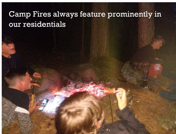
Camp Fires always feature prominently in our residentials

Finland 2022 We are glad to report that after almost three years of travel restrictions and lockdowns we finally opened the cottage up to our youngsters again this year. The only draw back being that the airfares have increased hugely and will limit our future use if they don't fall back to pre-pandemic levels before next summer. Because of these difficulties we didn't manage any winter trips this year but are planning some for February next year when we hope to take the summer youngsters back to walk where they