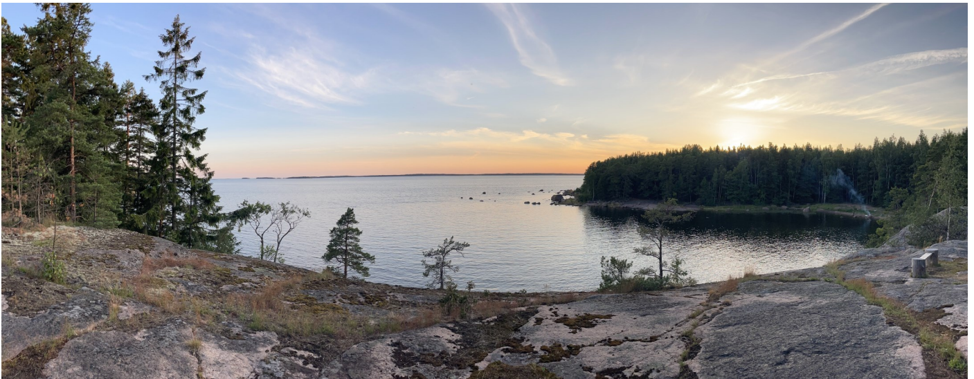
The view from the top of our 'garden' in Finland. Taken in July this year!