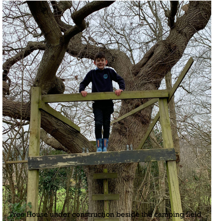
Tree House under construction beside the camping field