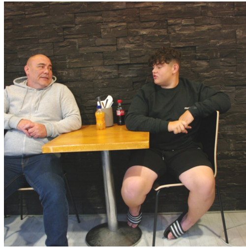
Eating together gives the staff so many opportunities for teaching.