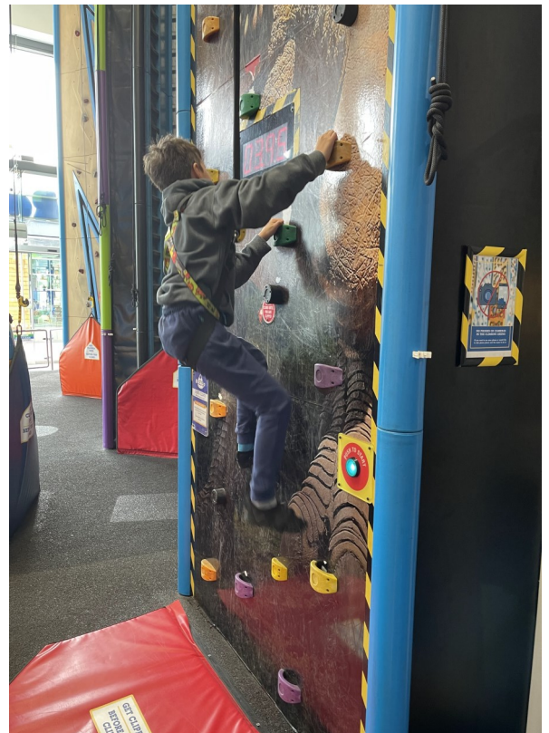
Action shot 'Rock Climbing' ... Great for building confidence as well as expending energy!!