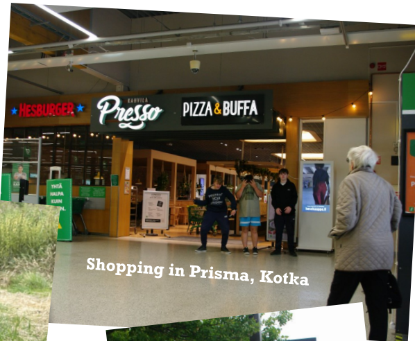
Shopping in Prisma, Kotka