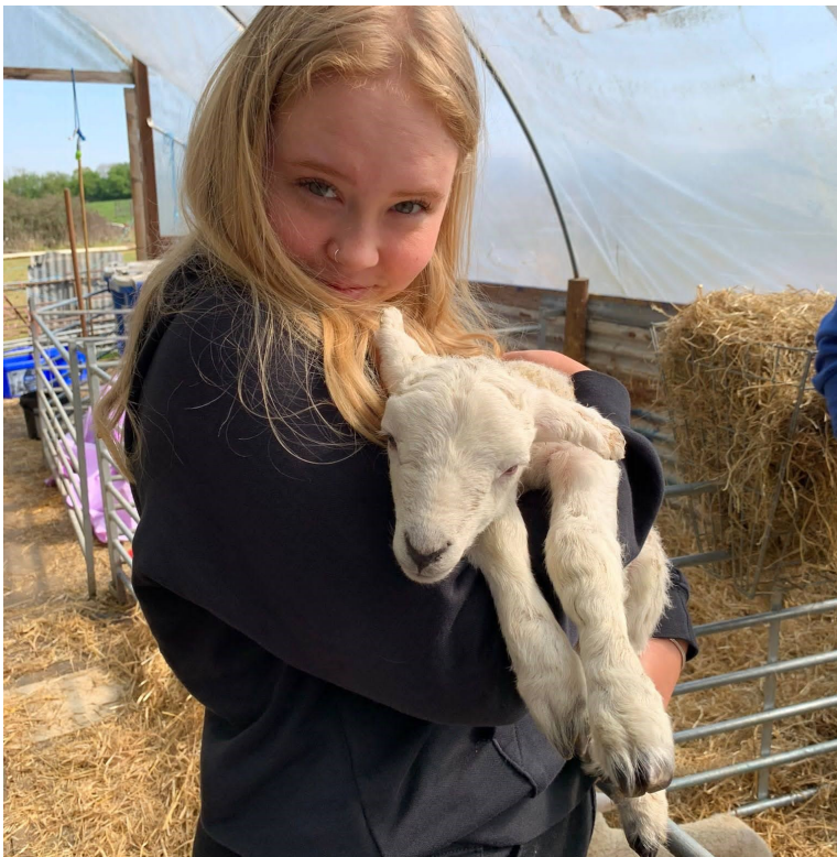
Lambing went well on our Rural centre this year. A biological education for many of the young people!