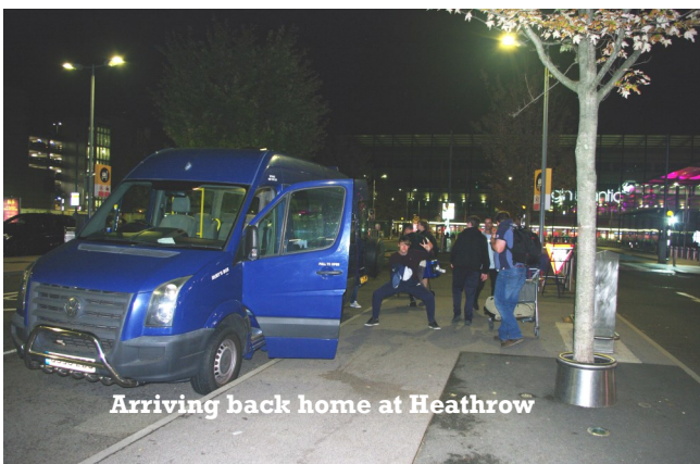
Arriving back home at Heathrow