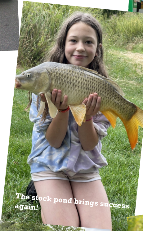
The stock pond brings success again!