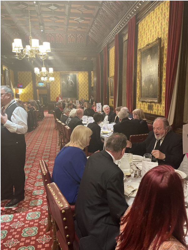
The House of Lords Dinner was a resounding success. It was so good to return after a Covid induced break !

Coming out of lockdown, the Russians invading Ukraine, the spiralling cost of living, threat of recession and inclement weather have brought about a disappointing end to the years fundraising. When faced with these and other issues it is not surprising that donations from individuals have slowed considerably. Funding from Trust Funds has held up much better but company and private donations have fallen to a level where our income has meant we have had to make some cuts in our spending and services. This is ok and we have not had to substantially cut any of our services. This has partly been helped by the fact that we have not had a full programme of residentials at our cottage in Finland. It is however a concern for next year. We recently got the current price rate of electric to us and used this years consumption as a guide. If it stays the same then we will have to pay £53,000 in 2023 for our electric! But in the finest British tradition we will cross those bridges when we come to them.