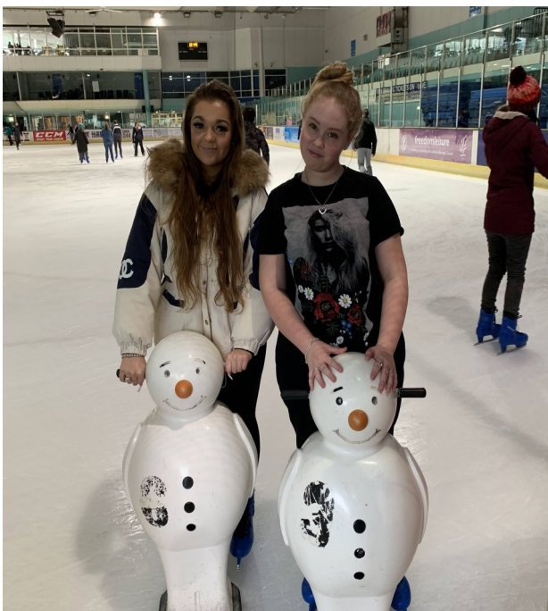
Ice Skating can take many forms!