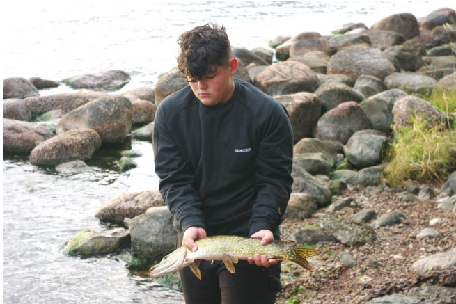
A Baltic Pike - Caught right in front of our cottage!