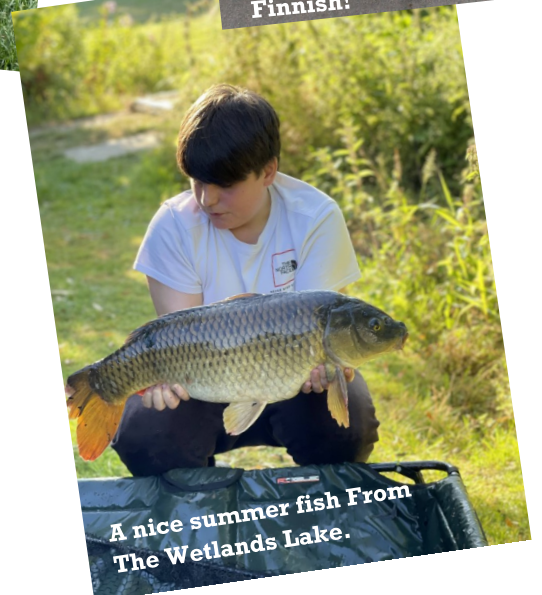
A nice summer fish From The Wetlands Lake.