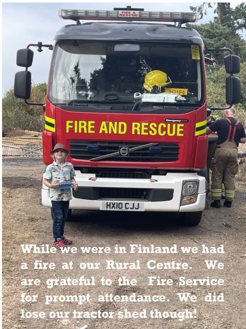
While we were in Finland we had a fire at our Rural Centre. We are grateful to the Fire Service for prompt attendance. We did lose our tractor shed though!