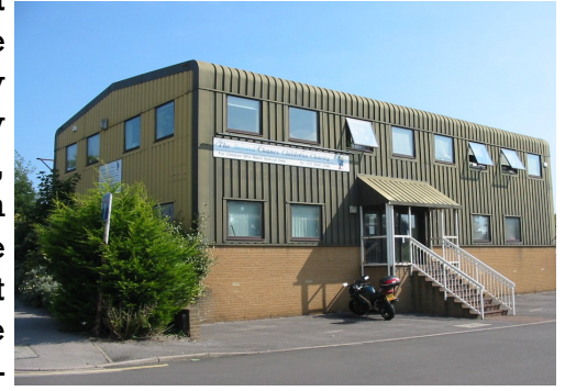
Second Chance House in Portsmouth. Portsmouth City Council have decided to charge us for not charging them!

We have had to borrow money from the building fund in order to avoid a court order. We don't think that's exactly friendly for an authority that we have saved millions of pounds for over the years. It's especially unfair in that although they say they cannot afford to be discretionary we know of dozens of other charitable organisations in the city that don't get charged. Although the City Council tell us they are charging other charities we don't actually know anyone who is being charged! We house, free of charge, another charity in the city and would not dream of charging them or passing a charge on.. Do unto others and all that! Hence the headline about biting the hand that feeds it. We wonder if it would be better to pull out of Portsmouth and just transport the children we are working with to our Rural Centre where Winchester City Council honour and help us.