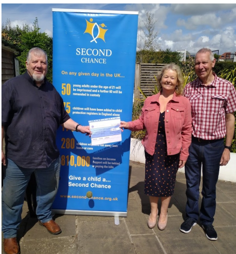
Cheque Presentation for £509 from South East Hampshire Masons Festive Board.

The problem with this year is that dividends and investments have not done as well as they might in normal times and the trust funds and companies that relied on the performance of these to donate to us have had diminished returns and therefore they have been unable to pass as much or anything on to our work this year. Ignoring the funding we gained to build our new facility at The Rural Centre we are more than £100,000 down on our expected income this year. This is not disastrous because as you will see elsewhere in this account we have not spent as much because of the pandemic. None the less it has meant budget trimming in order to survive and there are things we either wanted or needed to do that we haven't been able to (not helped of course by Portsmouth City Councils bill).