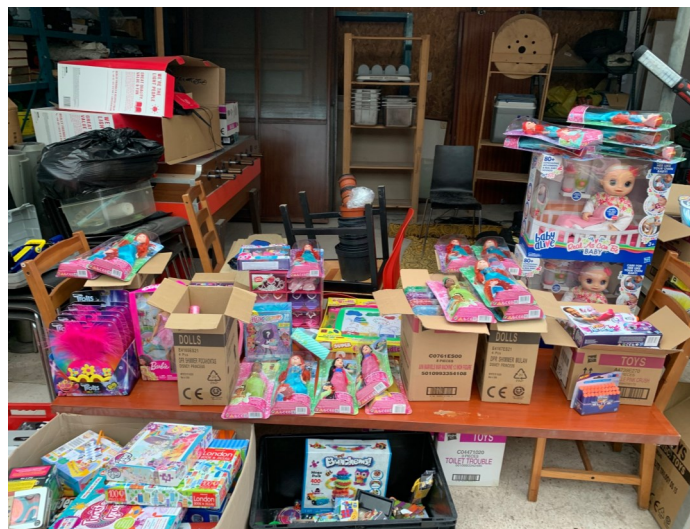
Thanks to Wave 105 , the local radio stations Christmas Appeal, we had bundles of presents for our underprivileged children at Christmas.