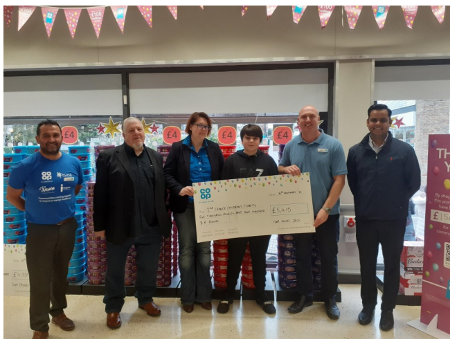
Our Local Co-Op Stores Raised £5,415. Here is the presentation in The Highland Road store in November.