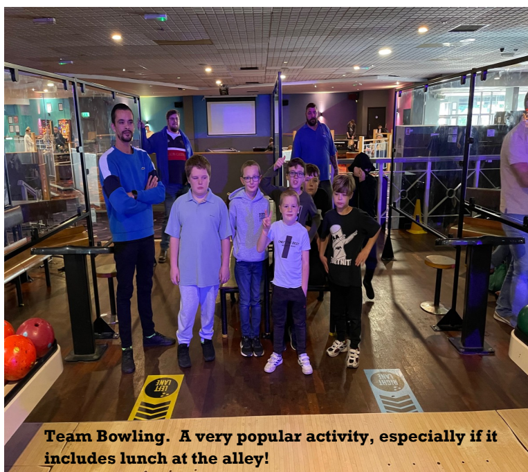
Team Bowling. A very popular activity, especially if it includes lunch at the alley!

Many of our children will leave school without any meaningful qualification (indeed that is if they went to school at all). This is not to say that most of them lack any intelligence, far from it. So we aim to teach them or help them discover qualities that will make them highly employable. Social skills are top of the list, work ethic is high too and generally a realisation that being a nice person can have its rewards and get you noticed. This is not easy and we have to get inside their heads and win their confidence to do this. A lot of this can be done in social and leisure activities. Don't confuse this with the old chestnut of rewarding bad behaviour... our youngsters really earn anything we give them. Here are a few activities we have repeated throughout the year.