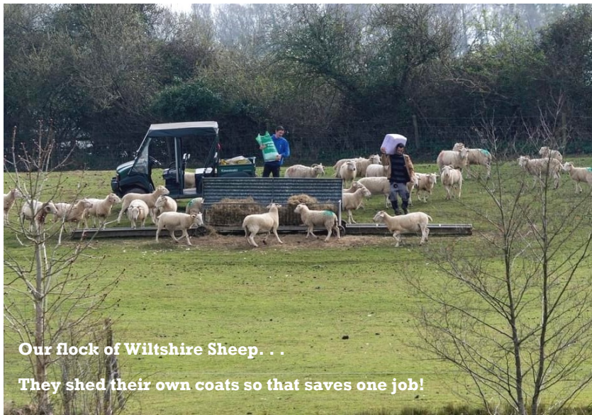
Our flock of Wiltshire Sheep. . . They shed their own coats so that saves one job!