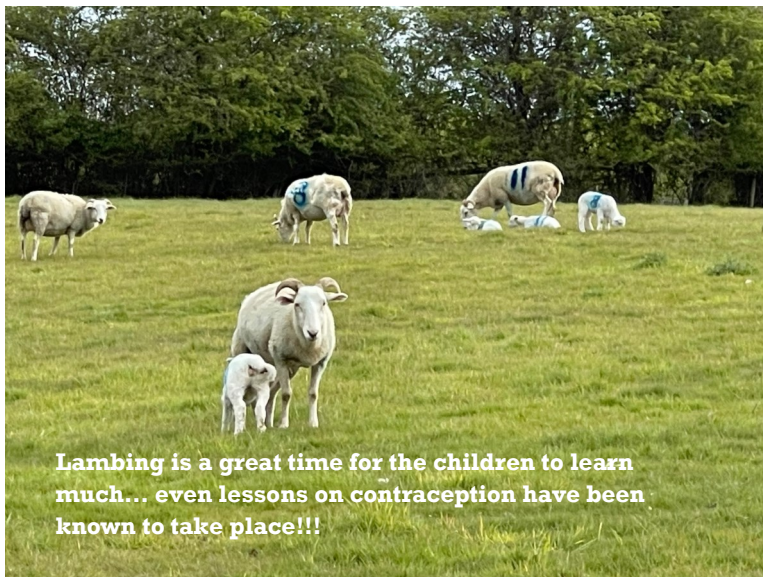
Lambing is a great time for the children to learn much... even lessons on contraception have been known to take place!!!

The sheep give biological and life lessons, the chickens, cows and other animals all contribute to a valuable life experience for the young people and allow us to work on their social skills too.